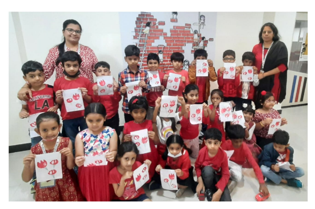
Let's Celebrate THE RED DAY, We Say!